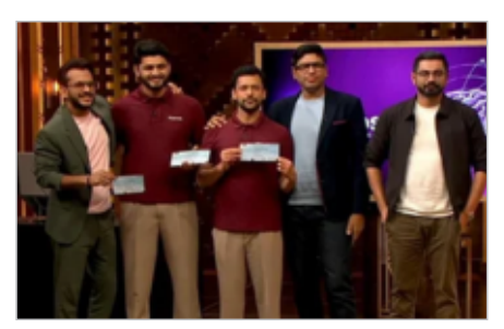
Aignosis - Shark Tank India