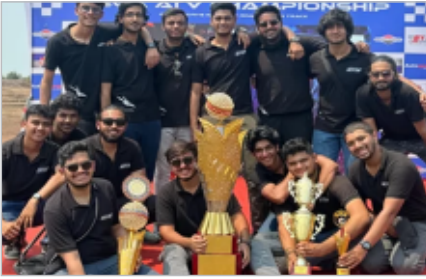
Aravalli Terrain Vehicle Championship