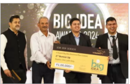
V-Guard Big Idea B-plan Competition