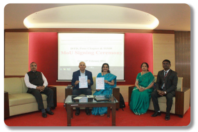
MoU Signing Ceremony