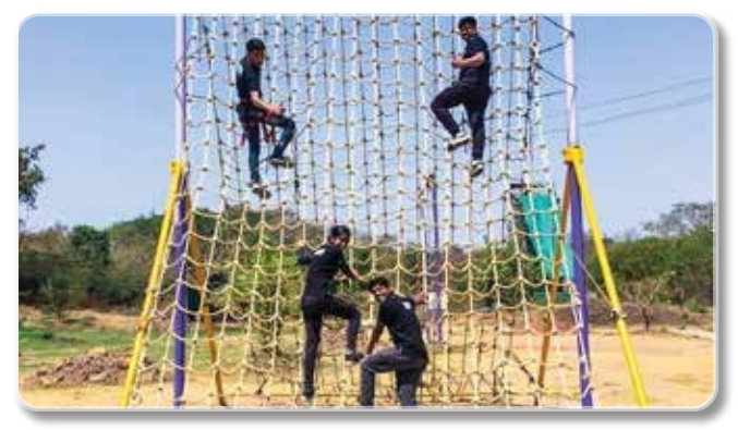
Outbound Training Program