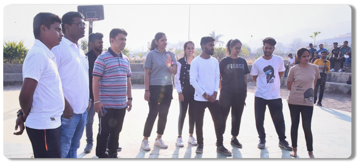
Team Building Activity