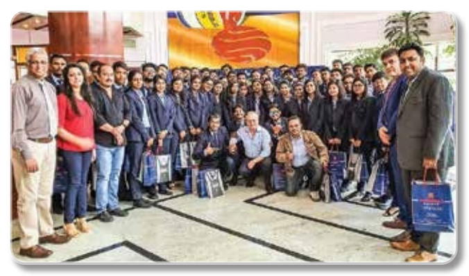
National Paints, Abu Dhabi