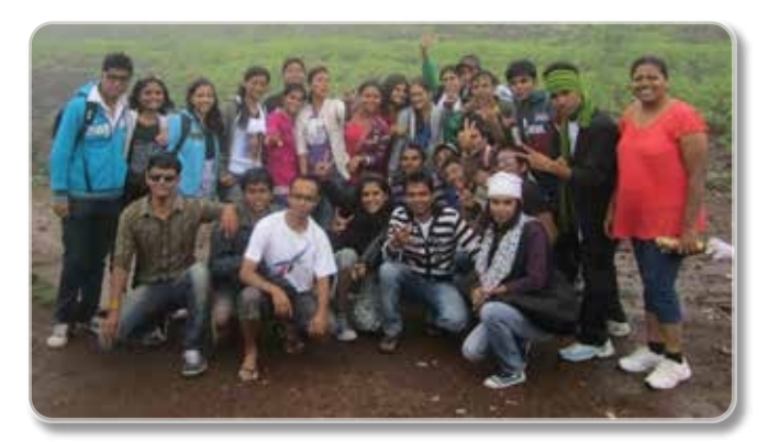
Picnic @ Mahabaleshwar