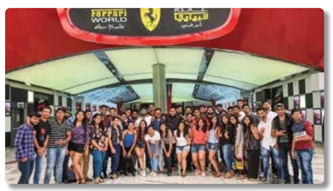
Ferrari World, Abu Dhabi