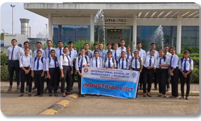
Advik Hi-Tech, Pune