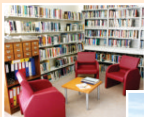
◀ Library Stack - Section