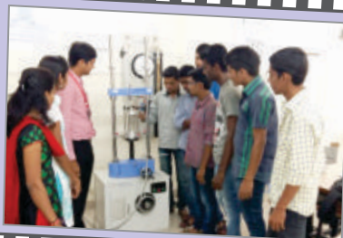
Civil Engineering Department